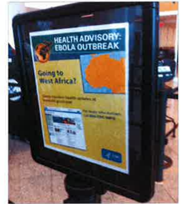
Health advisory for airline travelers